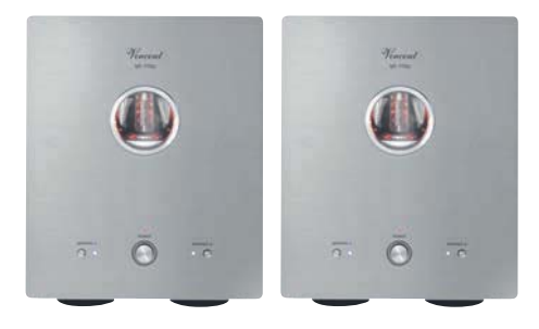
SP-T700 Class-A Hybrid Monoblock Amp