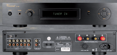
SV-400 Integrated amplifier

Frequency Response: 10 Hz – 20 KHz +/-0,5 dB Output Power RMS 8 ohms: 2 x 50 W Output Power RMS 4 ohms: 2 x 80 W Distortion: < 0,1% (1 kHz, 1 W) Input Sensitivity: 200 mV Signal to Noise Ratio: < 90 dB Input impedance: 47 kOhm Inputs: 5 x RCA (Stereo), 1 x USB Outputs: 1 x RCA Pre out (Stereo), 2 x 2 loudspeaker clamps Colors: Black or Silver Dimensions: 430 x 98 x 345 mm Weight: 9,5 kg