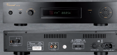
STU-400 AM/FM Tuner

Frequency Response: 10 Hz – 20 KHz +/-0,5 dB Output Power RMS 8 ohms: 2 x 50 W Output Power RMS 4 ohms: 2 x 80 W Distortion: < 0,1% (1 kHz, 1 W) Input Sensitivity: 200 mV Signal to Noise Ratio: < 90 dB Input impedance: 47 kOhm Inputs: 5 x RCA (Stereo), 1 x USB Outputs: 1 x RCA Pre out (Stereo), 2 x 2 loudspeaker clamps Colors: Black or Silver Dimensions: 430 x 98 x 345 mm Weight: 9,5 kg